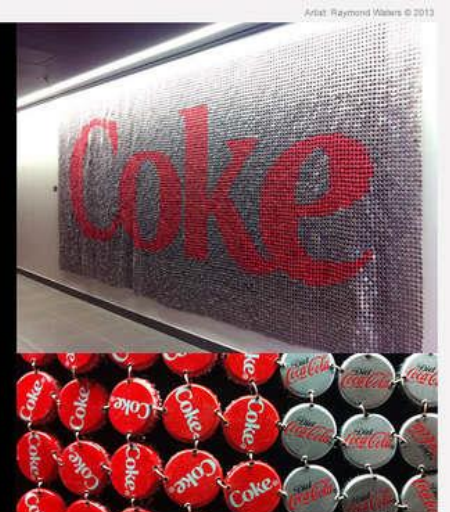
Artist: Raymond Walters © 2013