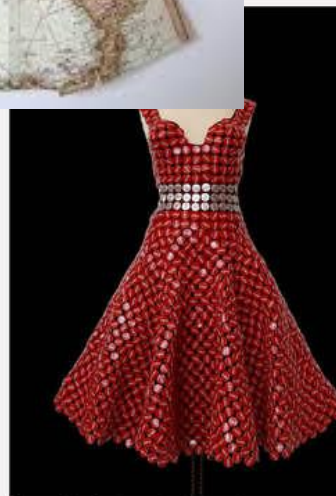
Coca-Cola Couture Sculpture No.1 2,500+ Coke and Diet Coke bottle caps, copper wire, silk & cotton with zipper and thread underdress on mannequin with wheels 2013. Size 8 US/CA.